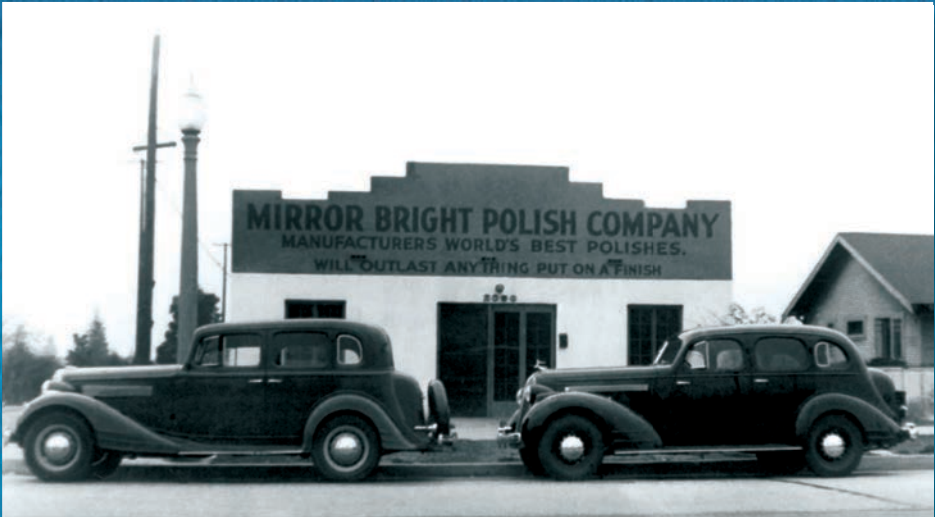
The family business grew out of the garage and into the manufacturing plant shown above in 1936.