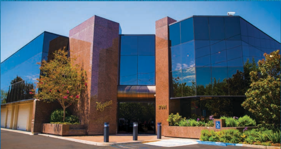
Meguiar's Global Headquarters in Irvine, California.