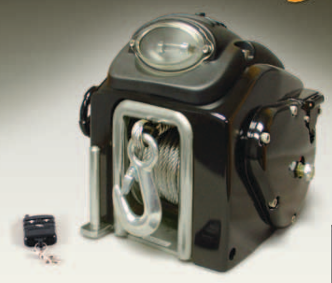
Both the RC 30 & RC 23 include: