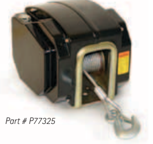
▶ Vertical lift capacity of 1650 lbs (Not to be used as a hoist)